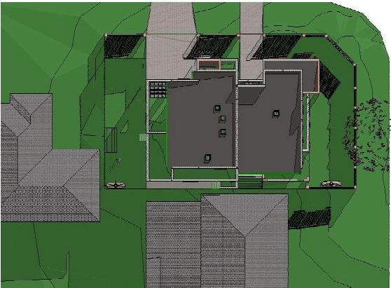
An aerial photograph of a proposed development site. The site is bounded by a green line, likely a property boundary. Inside the boundary, there are several buildings: a large, dark grey rectangular building in the center, a smaller grey building to its left, and a larger grey building to its right. There are also some smaller, lighter-colored structures. The surrounding area is mostly green, indicating grass or trees. A road or path runs along the bottom edge of the site. A small yellow car is visible on the road. The image is a top-down view, showing the layout of the buildings and the surrounding landscape.